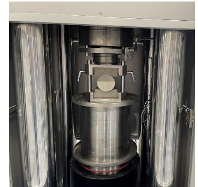
Indirect tension Brazilian & point load fixtures