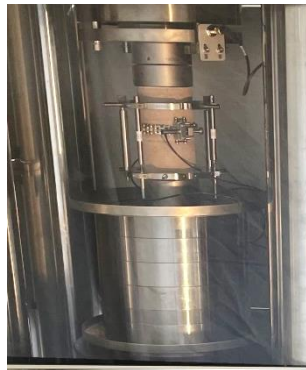
Uniaxial platen with strain gauges